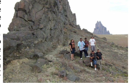
In front of the Rock with Wings or Shiprock

This year 6 from St. Louis, one from Oklahoma and a couple from Houston, Texas joined me for our annual outreach to the Navajo Indians at the Northern Navajo Nation Fair in Shiprock, New Mexico. I have been ministering to the Navajos since 1989 and this year the people we ministered to were the most receptive and hungry for the Gospel that I have ever seen. Something that really helped us have added rapport and favor with the Navajos was that 2 of those who went on the trip were Native Americans originally from Oklahoma. They were a great help to our ministry and I believe God is going to use both of these men in a mighty way to help bring revival to the American Indians. Some great men of God have prophesied that revival in America would begin with the Native Americans and from the spiritual hunger and receptivity that we saw in Shiprock I believe this revival has already begun.