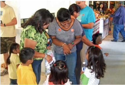
Sharing the Gospel with salvation bracelets