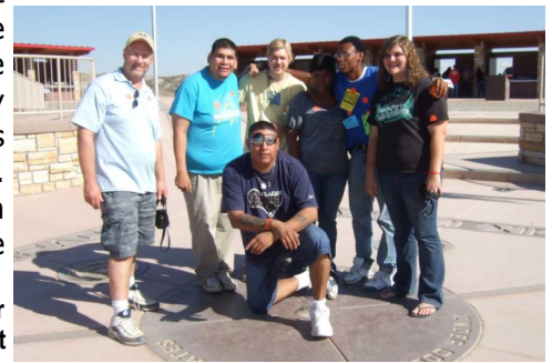
Right: At the Four Corners Monument