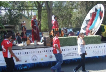
The big parade was on Saturday morning. The Gospel tracts we passed out gave people something to read as they waited for the parade to start.