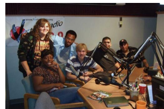
Our group on KNMI radio

Corners Spotlight. Navajo Ministries provided us with lodging in one of their homes while we were in Farmington for which we are very grateful.